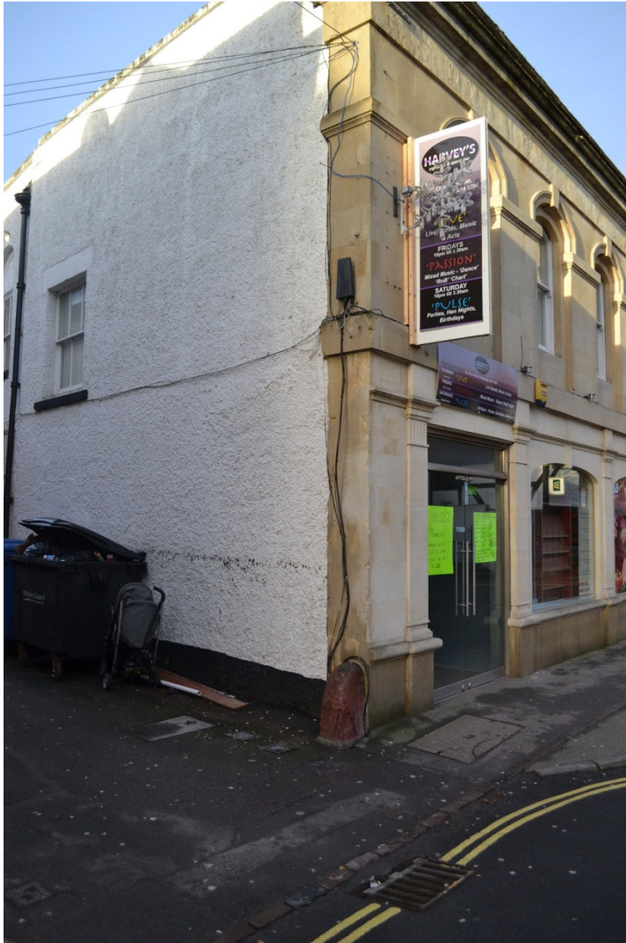
Photograph 5 -